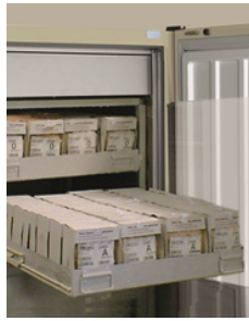
Custom made drawers upon request