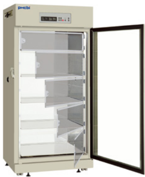
MCO-80IC with optional inner door kit (MCO-80ID-PW)